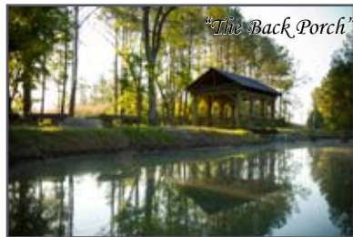
The Back Porch

include leisure trails, a gated entrance, and the "Back Porch" featuring a tranquil pond with gazebo, fire pit, and picnic area. A community garden is currently in the design phase. Conveniently