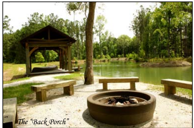
The "Back Porch"