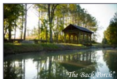
"The Back Porch"

amenities include leisure trails, a gated entrance, and the "Back Porch" featuring a tranquil pond with gazebo, fire pit, and picnic area. A community garden is currently in the design