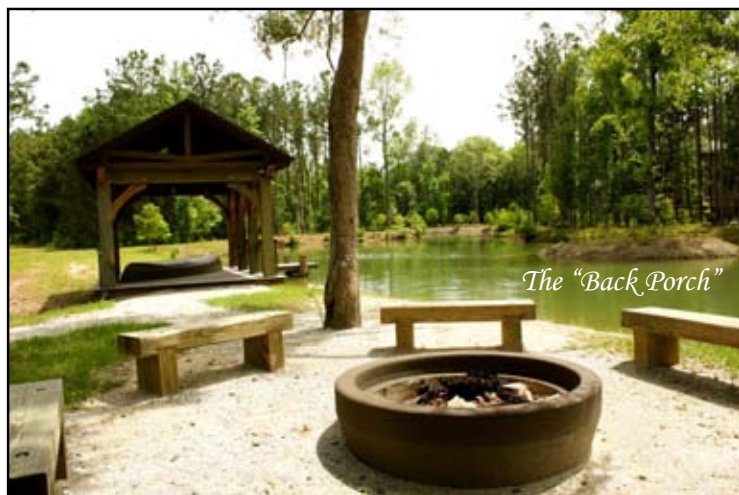
The "Back Porch"