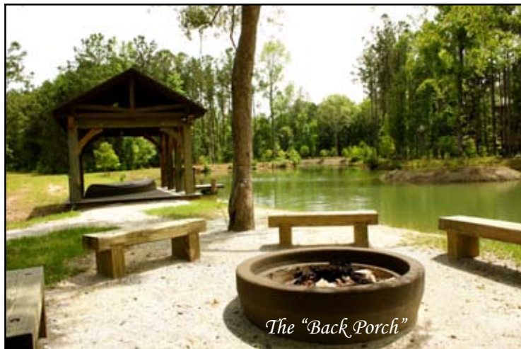
The "Back Porch"