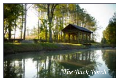
"The Back Porch"

nestled among freshwater wetlands, which creates a lush, natural environment residing along Penny Creek with two deepwater community docks accommodating 30+ boats. Other amenities include leisure trails, a gated entrance, and the "Back Porch" featuring a tranquil pond with gazebo, fire pit, and picnic area. A community garden is currently in the design phase. Conveniently located less than 15 minutes from downtown Charleston and the Country Club of Charleston, this peaceful and serene community setting is comprised of more than 65 homesites, with several custom homes already completed and sold.