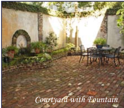
Courtyard with Fountain

This beautifully restored, "Historic Gem" dates back to at least 1716. Every detail has been meticulously researched and consulted by two specialists focusing on pre-revolutionary architecture. The third floor addition, which was added back to this home after discovering it was lost in a previous fire, easily transitions to the old structure while comprising the full floor master suite with a fireplace, sitting area, relaxing porch overlooking the courtyard, luxurious bath, and wonderful storage. The elegant second floor drawing room is gracious and bright, and boasts lovely views of Church Street from the balcony. Two charming, private guest suites with private baths and sitting areas are also located on the second floor. The first floor is filled with original architectural integrity with working fireplaces located in the front living room and dining room. The updated kitchen includes custom cabinets,