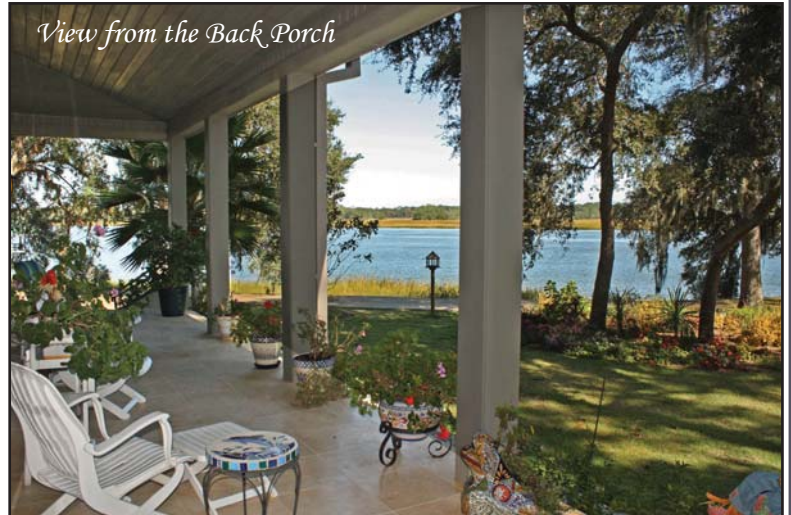
View from the Back Porch