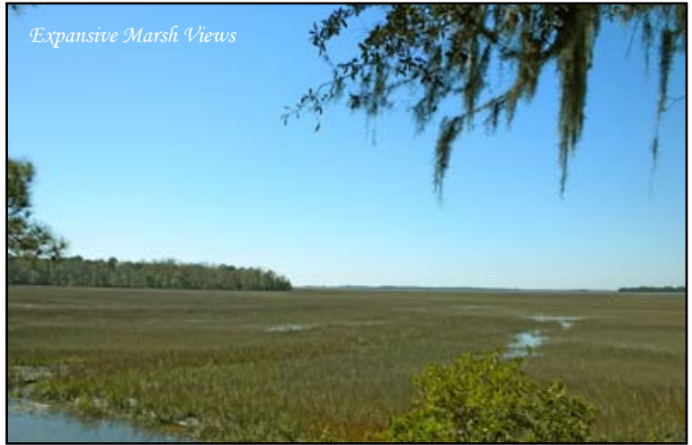
Expansive Marsh Views

Nearly 8 acres on Charleston County's southern most barrier island, Bailey Island is an incredibly beautiful and pristine environment, surrounded by the South Edisto River on two sides, the St. Pierre, and Bailey Creek. Bailey Island is located in the heart of the ACE River Basin where there are incredible views in every direction and the open ocean is less than 2 miles away. This is a rare opportunity to own a creek front estate lot with existing floating boat dock, expansive marsh views, and incredible sunsets. There is also a community boat ramp and dock. This center island is ideal for nature walks and fresh water ponds for fishing. This is truly one of the most beautiful locations in South Carolina. Buyer to verify acreage