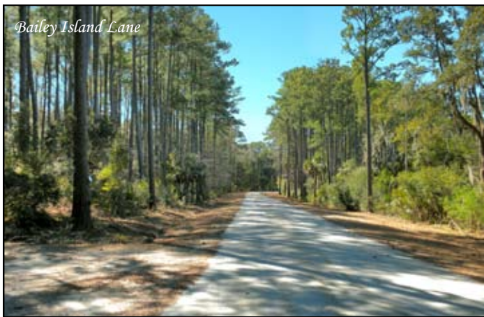
Bailey Island Lane