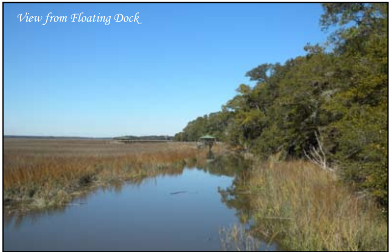
View from Floating Dock