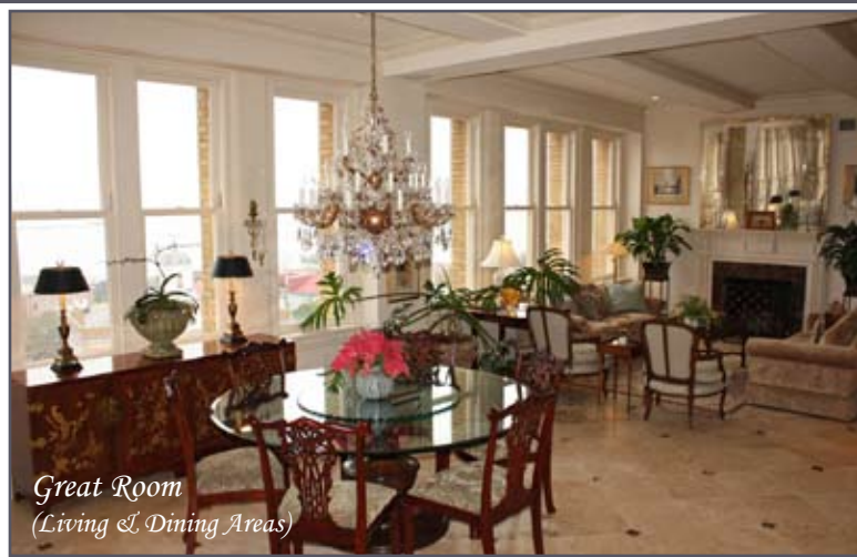
Great Room (Living & Dining Areas)